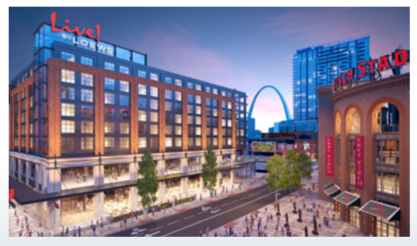
WCI will meet at the new Live! by Loews-St. Louis in early November.

fter last year's Annual Meeting and Fall Symposium were held virtually due to COVID-19, this year, WCI will hold its Annual Meeting, Board of Directors meeting, other WCI meetings and the Symposium in-person, November 2–4 in St. Louis at the Live! by Loews hotel near Busch Stadium.